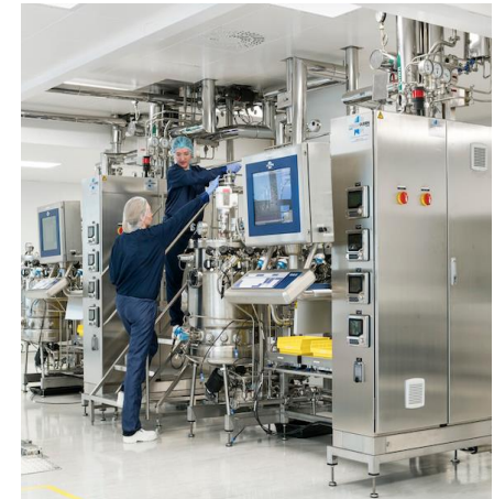
NIBRT - National Institute for Bioprocessing Research and Training